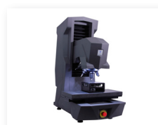
HZ50-4 hardness tester