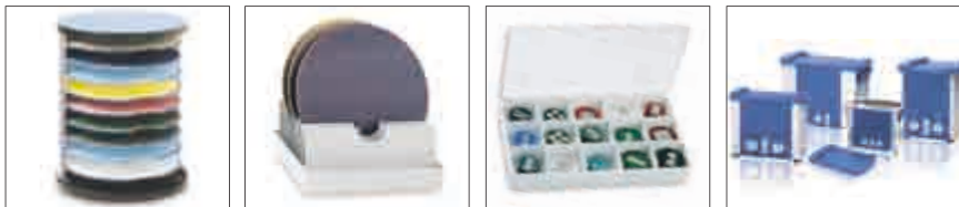
Storage rack for your consumables