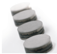
Intermediate ram Ø25.4mm - On request Ref. 53999

The intermediate rams allow two simultaneous mountings using a single mold.