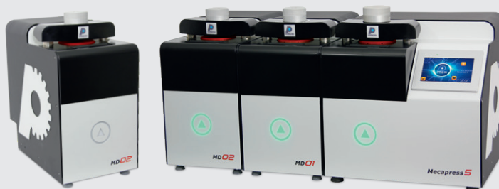
Mounting unit MECAPRESS 5 Ref. 53110

Increase your simultaneous sample mounting capacity