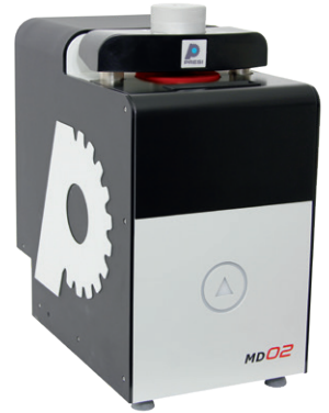
MECAPRESS 5 mounting unit Ref. 53110