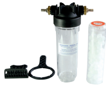
Refill cartridge for MECAPRESS anti chalk system Ref. 53521