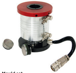
Mould set Ø25mm - On request Ref. 53999