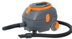
Vacuum unit for MECAPRESS Ref. 53140