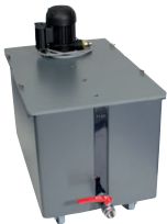
Stainless steel recirculation tank and pump system (55l) Ref. 53145